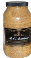
New improved container