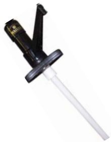
Also available the 1 gallon pump

Item #10000 Dijon Mustard Package size: 4/1gal